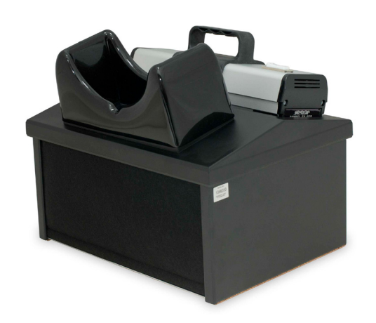
CM-26A UV VIEWING CABINET