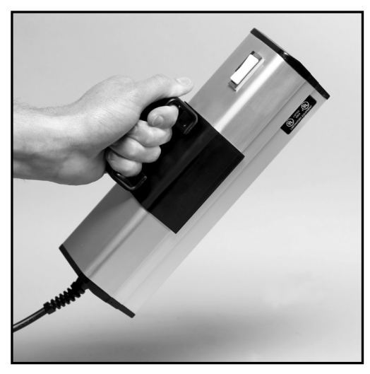
LAMP WITH CARRYING HANDLE